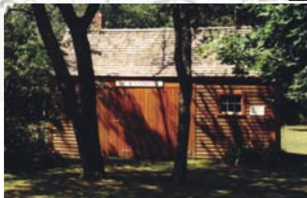
❖ Working Blacksmith Shop