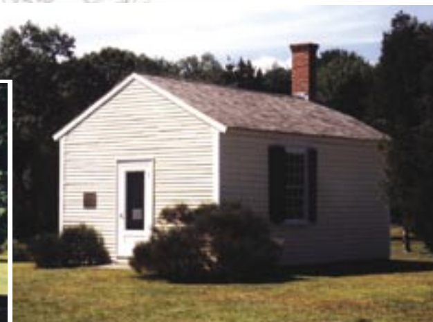
❖ Daniel Webster's Law Office